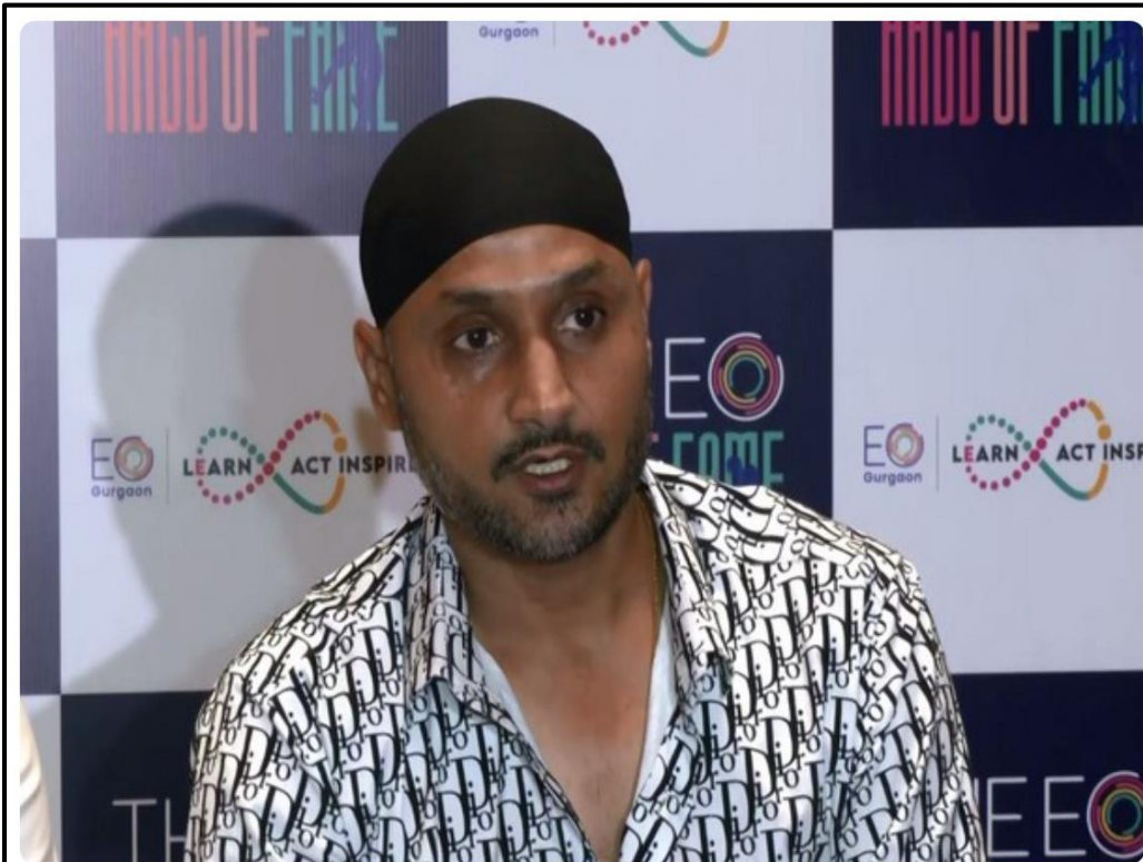
Harbhajan Singh